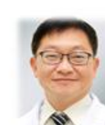
Wirat Kongcharoensombat Lerdsin General Hospital